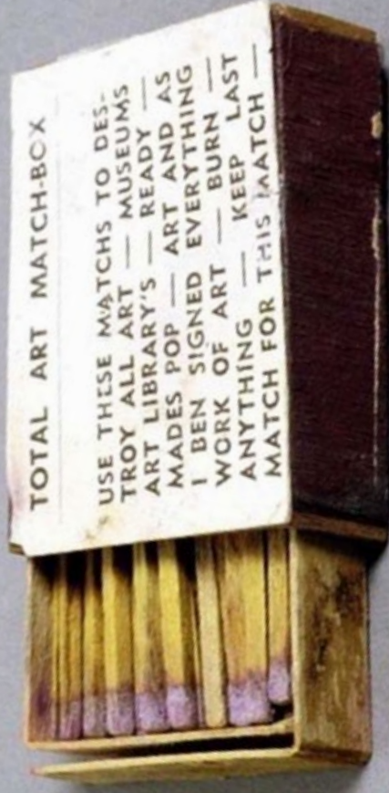
Ben Vautier Total Art Match-Box, 1965