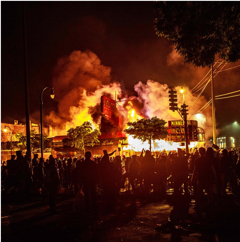
Burning MPLS cityscape during George Floyd uprising