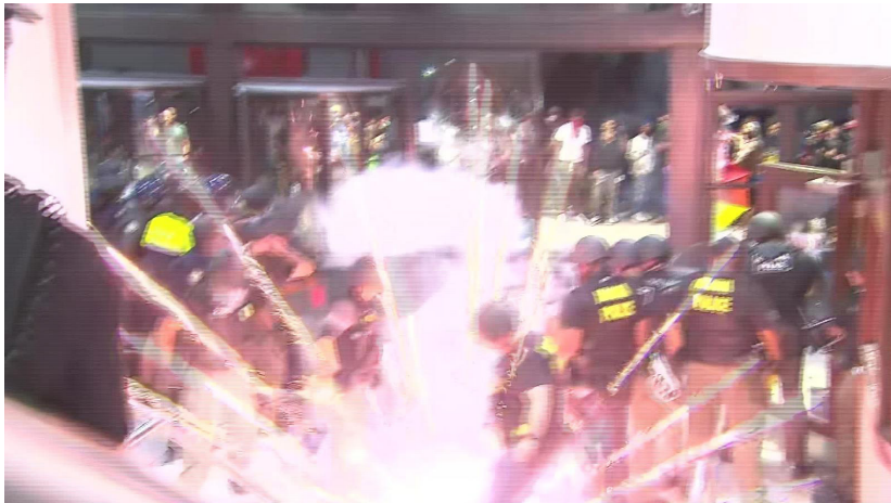
Explosion in CNN headquarters. Atlanta, GA

leads many to a docile state in even the most dire situations. There was no rational positive political project to liberate the lagers from the inside, just as there is no positive political project that will destroy the US or the police. When presented with a futile situation, does one remain docile or does one decide to fight? The decision to fight against an insurmountable system is not a rational political project aimed at progressing to a better future, it is a decision to do so in spite of the lack of that future. Within this decision is a choice to pursue an unknowable orthogonal 4 future, to break not just the perceived linearity of time, but break the dimensionality of that time, it's simply a yes or no. In the text there is a story about a rebellion spurred by a woman whose name has been confused by the oral tradition, who shot an SS guard to death inside a woman's dressing room. This action became mythos in the camp and also inspired a later rebellion the same day. It also reminded those enslaved that the SS were mortal. What happened at the 3 rd precinct reminds us it was just a building. Watching police drop to the ground after a brick strikes them in the head reminds us they are mortal.