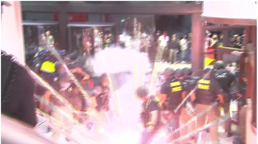
Explosion in CNN headquarters. Atlanta, GA