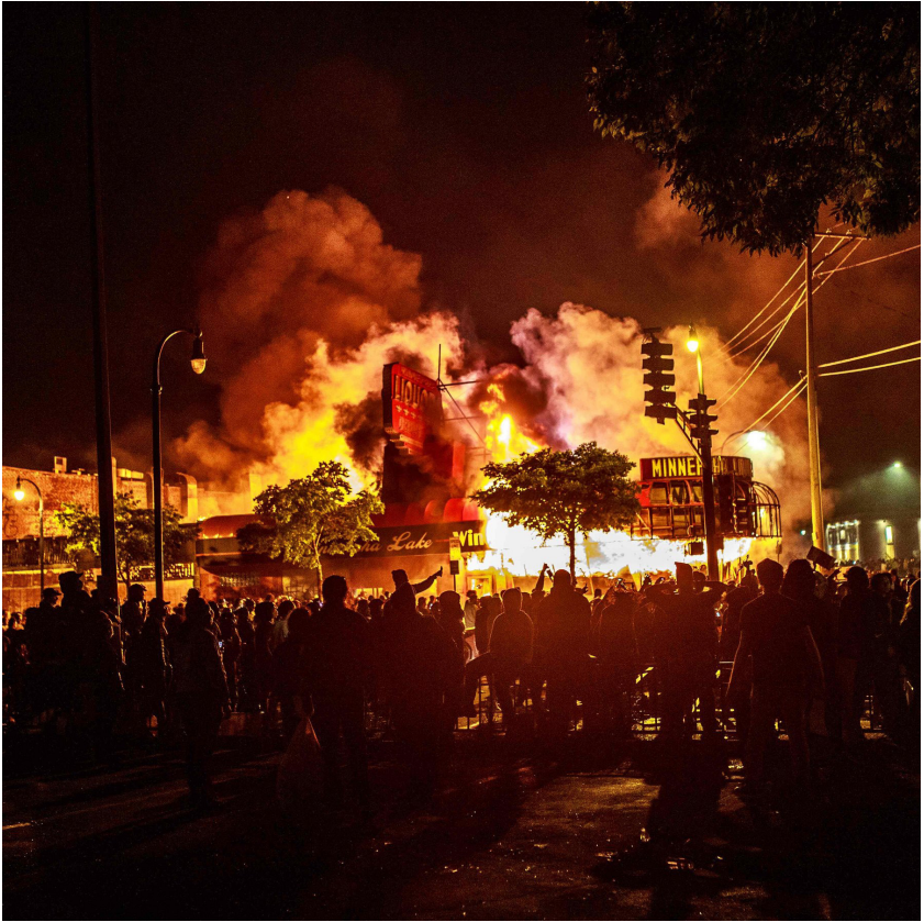
Burning MPLS cityscape during George Floyd uprising