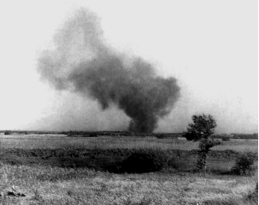
Clandestine Photograph of Treblinka during the uprising

Cover: Overhead image of the Watts Rebellion